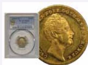
1 dukat 1849/4