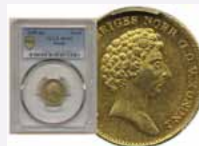
1 dukat 1839