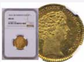
1 dukat 1822