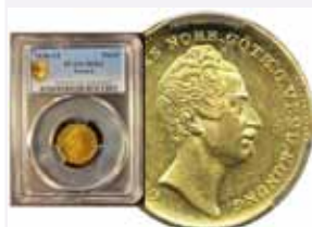
1 dukat 1858