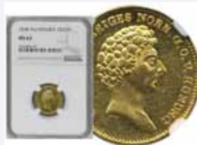
1 dukat 1838