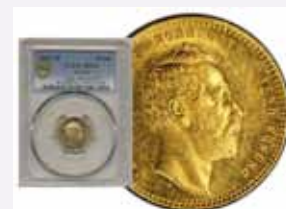
1 dukat 1865

Coins • Banknotes • Stamps • Postal History • Literature