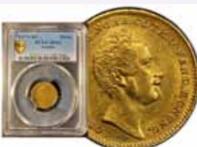
1 dukat 1847/4