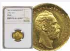
1 dukat 1864