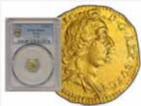
¼ dukat 1733