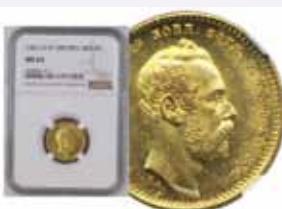
1 dukat 1861/0