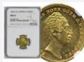
1 dukat 1850