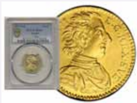
1 dukat 1714

Online shop with 1000s of items available for direct sale without any added commission