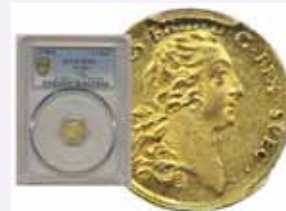
¼ dukat 1755/4