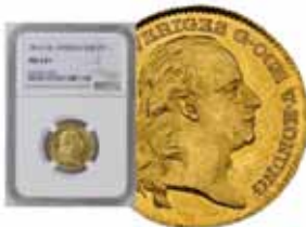
1 dukat 1812