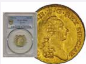
1 dukat 1778