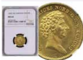
1 dukat 1843