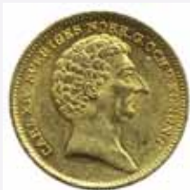
2 dukater 1839