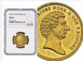
4 dukater 1837