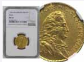
1 dukat 1745