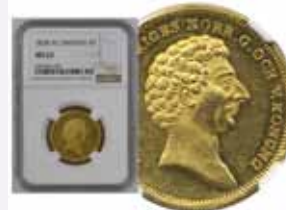
4 dukater 1838