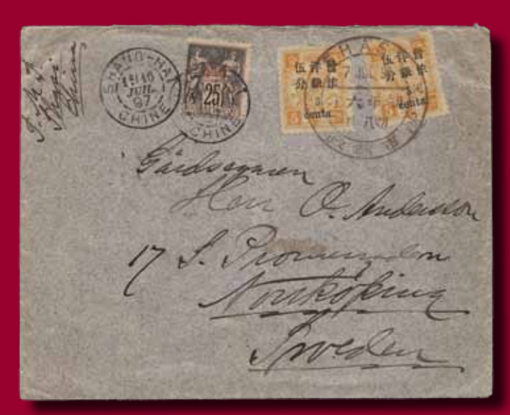
Sold for 824 000 SEK