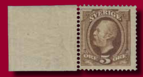
Sold for 106 000 SEK