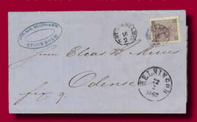
Sold for 72 000 SEK