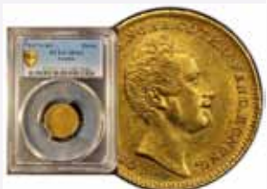
1 dukat 1847/4