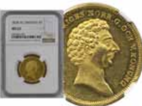
4 dukater 1838