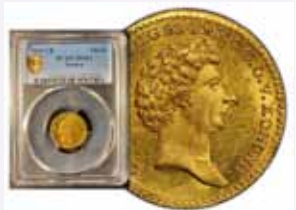
1 dukat 1830