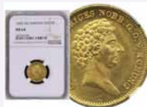
1 dukat 1843