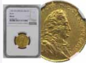
1 dukat 1745