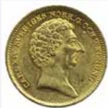
2 dukater 1839