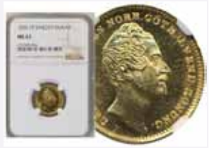
1 dukat 1856

Coins • Banknotes • Stamps • Postal History • Literature