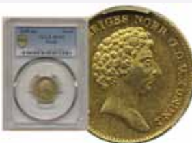
1 dukat 1839