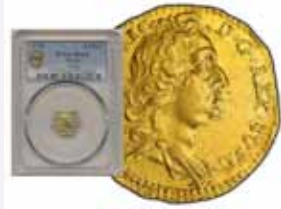
1/4 dukat 1733