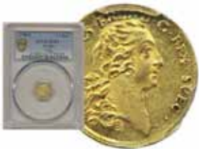
1/4 dukat 1755/4