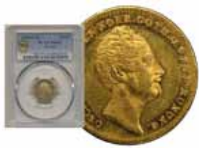
1 dukat 1849/4