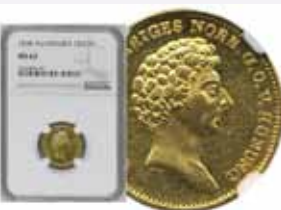
1 dukat 1838