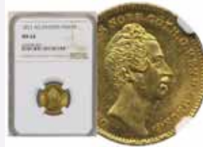
1 dukat 1851