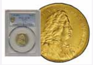
1 dukat 1745