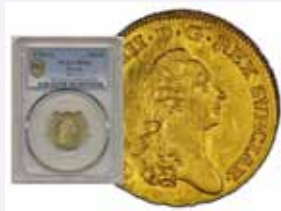
1 dukat 1778