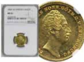
1 dukat 1850