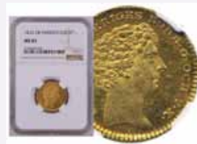
1 dukat 1822