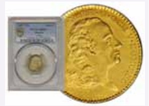
1 dukat 1817