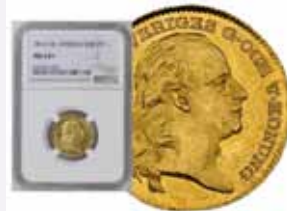
1 dukat 1812