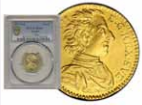
1 dukat 1714

Online shop with 1000s of items available for direct sale without any added commission