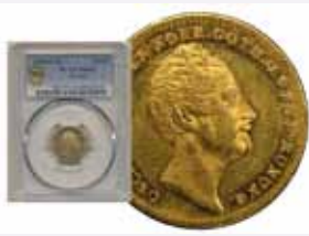
1 dukat 1849/4