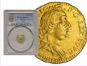
1/4 dukat 1733