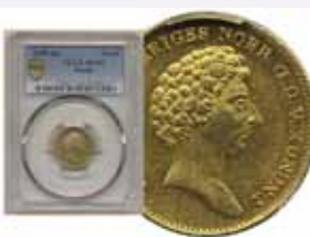
1 dukat 1839