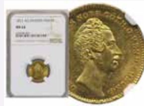
1 dukat 1851