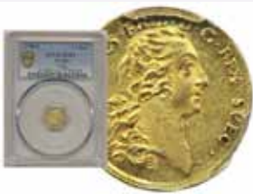
1/4 dukat 1755/4