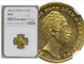
1 dukat 1850