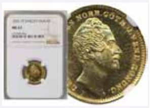
1 dukat 1856

Coins • Banknotes • Stamps • Postal History • Literature