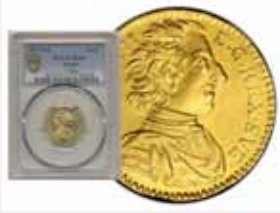
1 dukat 1714

Online shop with 1000s of items available for direct sale without any added commission